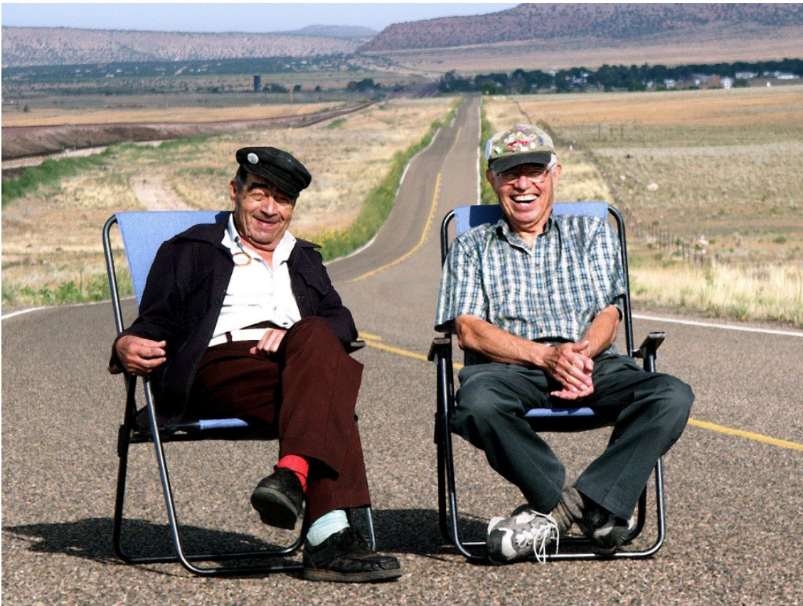
Historic Route 66: It's More than a Road; It's Her People (National Archives Identifier 7719420 )

Many thanks to all who joined us: more than 160 Citizen Archivists helped to enhance a whopping 5,577 pages from more than 1,200 records in the Catalog!