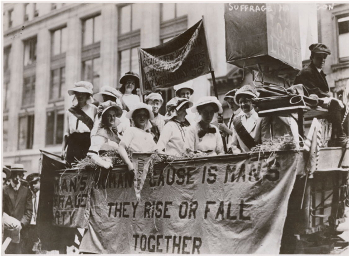
Photograph of Suffrage Parade, 1913 (National Archives Identifier 593561 )

Participants in this new course will learn how to improve Wikipedia's coverage of the history of women's voting rights in the United States in honor of an upcoming exhibit hosted at the National Archives Museum, Rightfully Hers: American Women and the Vote . Take an active role in ensuring that the world's most popular reference source is more representative, accurate, and complete. Apply to be a part of this unique initiative today!