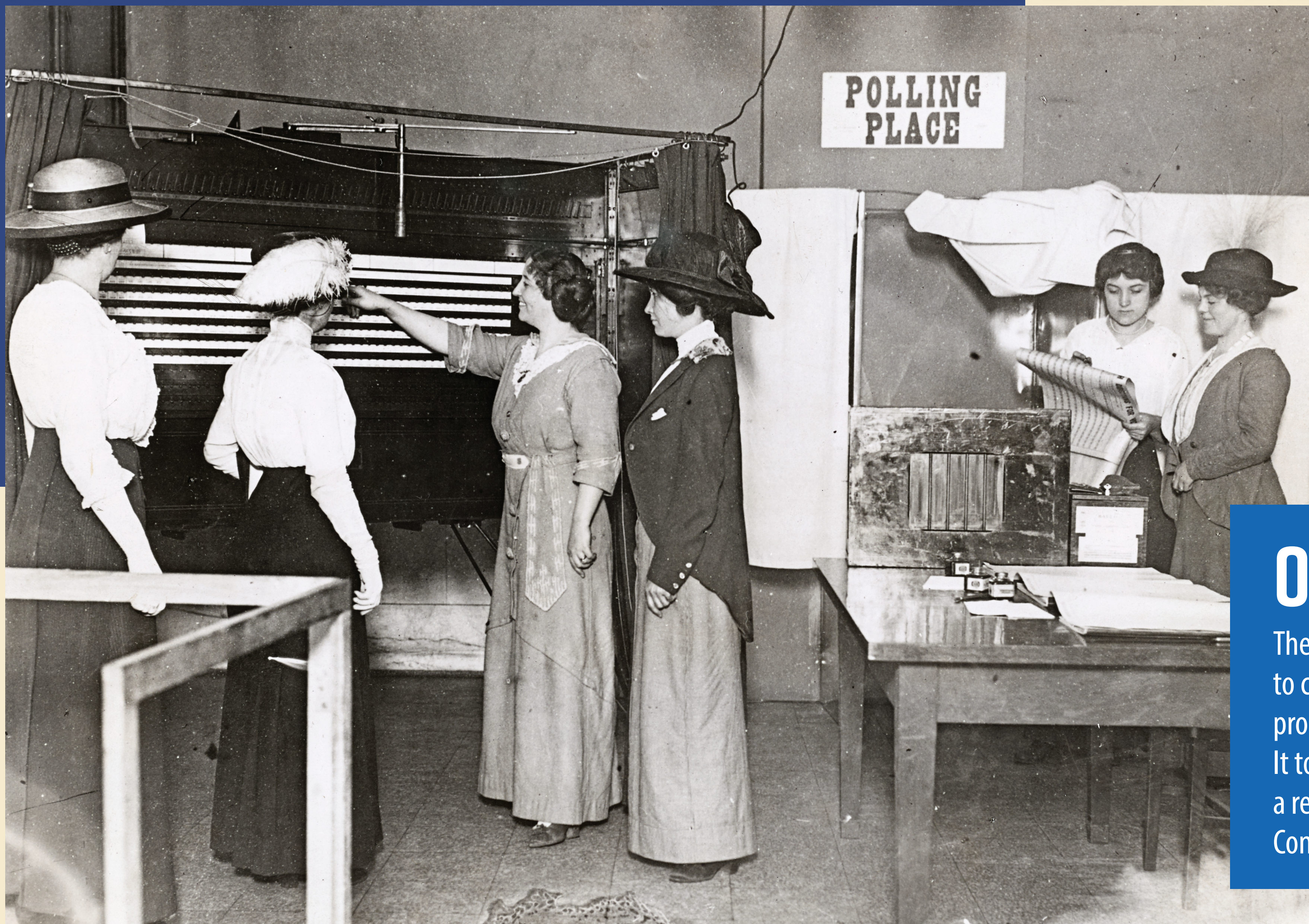
“Learning to use a voting machine,” Chicago, ca. 1915

end of March 1920 only one additional state was needed for ratification. On August 18, 1920, after calling a special session of the state legislature, Tennessee became the 36th state to ratify the 19th Amendment.