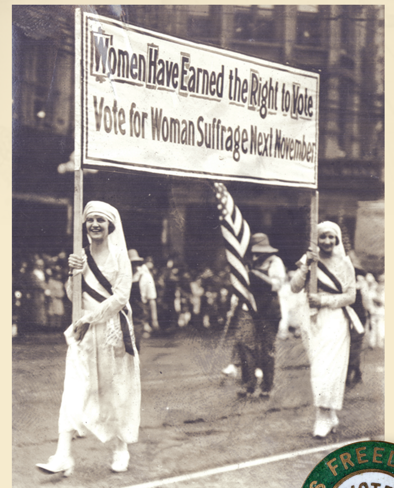
Women marching in suffrage parade, 1917