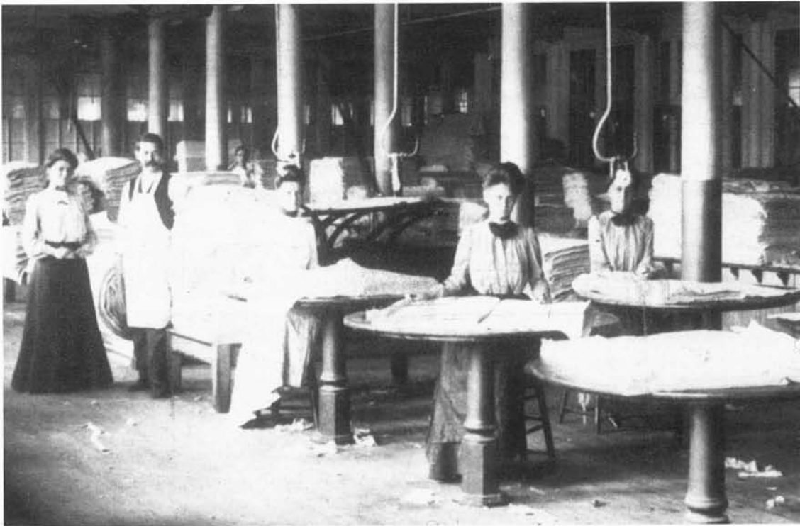
Workers in the Bates textile mill in Lewiston, Maine, in the late 19th century. A related story begins on page 12.

Visit us on the Web at www.nara.gov/nhprc/ or e-mail us at nhprc@nara.gov