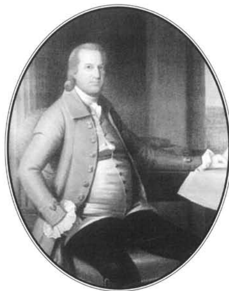
Oliver Wolcott (1726-97), signer of the Declaration of Independence and Governor of Connecticut, 1796-97. Portrait by Ralph Earle, ca. 1790.

Finding aids to the records of these two courts from the time of their establishment to 1855 will provide an overview of the research value of the documents, an outline of major subjects included, and a