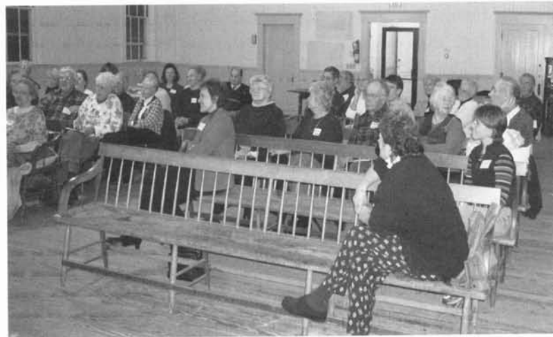
Audience at the Sanbornton Historical Document Foundation's Community Historical Forum, held on October 29, 2002, in the Sanbornton Town Hall.

In addition to the workshops, the project offers participants the opportunity to request a preservation needs assessment on behalf of their organization. The assessments are an integral part of the project and are intended to reinforce and augment what people learn at the workshops. To date, the project has awarded 40 assessments to local governments, public libraries, and historical societies. Each of these bodies has, at no cost to them, the professional