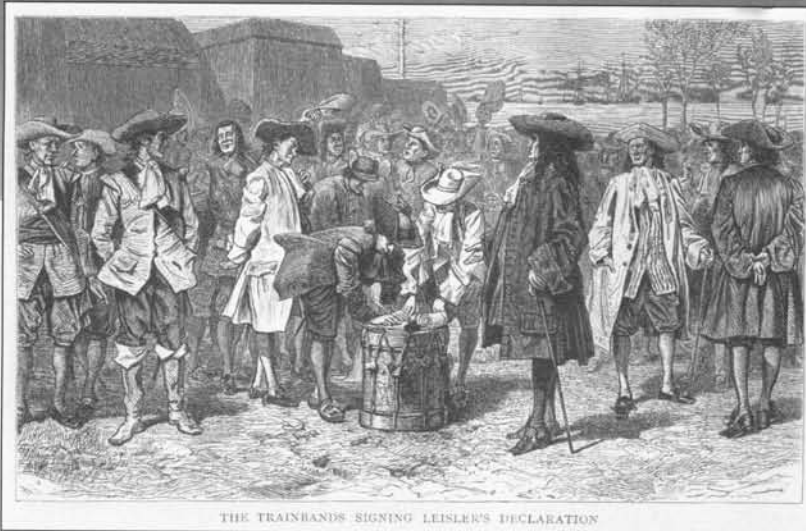
THE TRAINBANDS SIGNING LEISLER'S DECLARATION

Print from the author's collection, artist unknown.