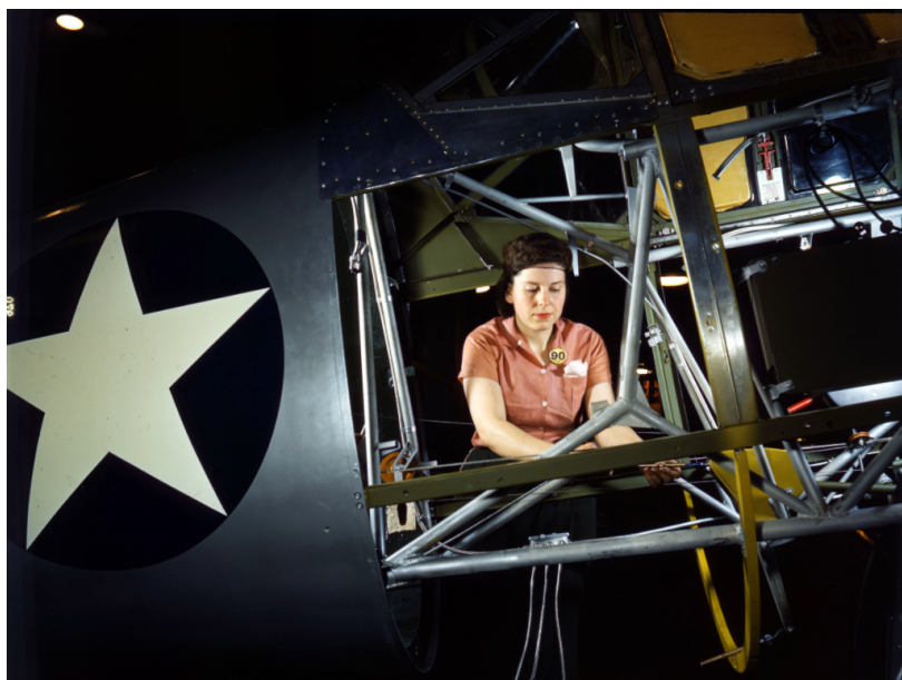
Woman Working on Inside of SNV Fuselage at Consolidated Vultee Aircraft Plant in Downey, California, 7/1943.

The U.S. Government, long committed to black and white film and equipment for 4"x5" and larger formats, only slowly began to appreciate the usefulness of color emulsions. As the military and civilian war efforts in the United States and overseas expanded, greater use was made of color materials in presenting these activities in a lifelike way. The color photographs in this series are the U.S. Navy's official color photography file chronicling the Navy's burgeoning roles and responsibilities during the war, illustrating all aspects of the navy's activities.