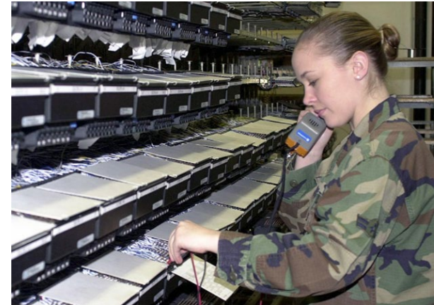
National Archives Identifier 6600730

We are also streaming at youtube.com/usnationalarchives