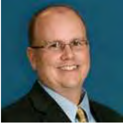
Director, National Personnel Records Center (St. Louis)