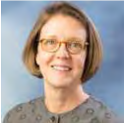
Executive for Research Services