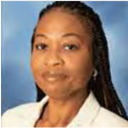
Chief Human Capital Officer

of Maryland in Accounting and Government and Politics.