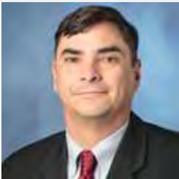
Director, Communications and Marketing