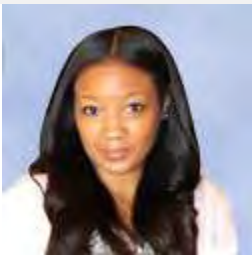
Director, Executive Secretariat