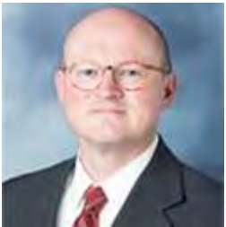
Director, National Declassification Center (NDC)