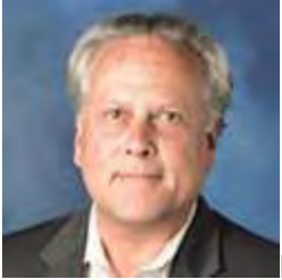
Director, Center for Legislative Archives