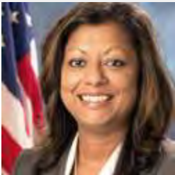
Chief Information Officer