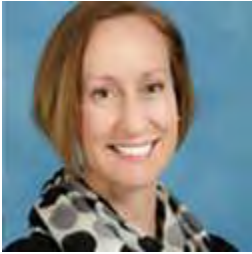
External Affairs Liaison