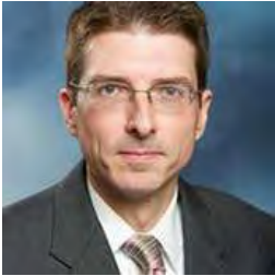
Chief, Management and Administration