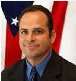
Executive for Agency Services