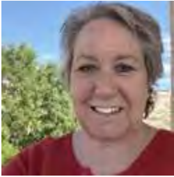
Acting Director, Office of Presidential Libraries