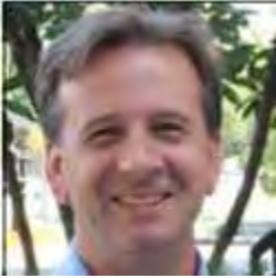
Director, Congressional Affairs