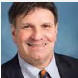
Director, Information Security Oversight Office (ISOO)