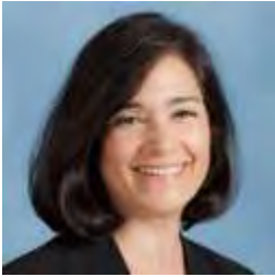
Chief of Staff