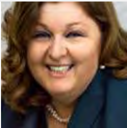
Director, Office of Government Information Services (OGIS)

He is a Phi Beta Kappa graduate of Washington & Lee University and holds an M.A. in Modern History from Oxford, which he attended as a Rhodes scholar, and a law degree from the University of Virginia.