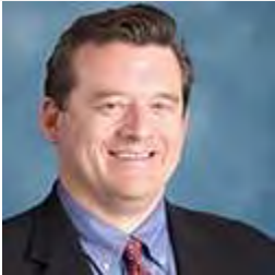
Executive Director, National Historical Publications and Records Commission (NHPRC)