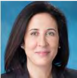
Deputy Archivist of the United States