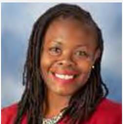
Director, Equal Employment Opportunity (EEO) Program