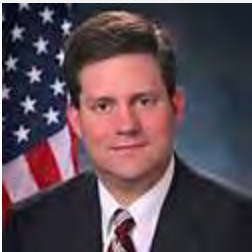
Chief Operating Officer