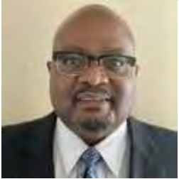
Director, Federal Records Center Program (FRCP)