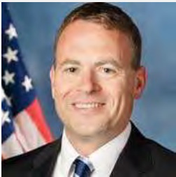
Director, Office of Federal Register