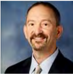
Chief Records Officer