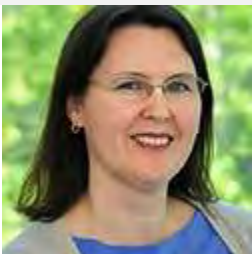
Director, Preservation Programs