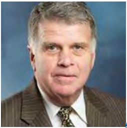
Archivist of the United States