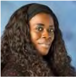
Chief Acquisition Officer