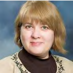
Chief Innovation Officer