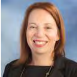
Chief Financial Officer